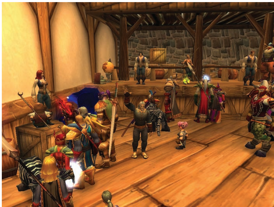
Fig. 1. The Stormwind Auction House in WoW. The three figures wearing vests and standing on platforms are the computer-generated auctioneers, whereas the dozen other figures are characters belonging to real human beings participating in auctions involving a thousand or more people. The one waving in the center is the avatar of a scientist who is studying this virtual world and the computer-assisted systems it provides to facilitate social interaction and economic exchange.

During this time of transition, when there is active speculation about the investment opportunities, it is exceedingly difficult to estimate the current economic impact of virtual worlds, let alone project the future. For example, a Web site called Wowhead that was merely about WoW recently sold for 1 million dollars, and the game’s $15 monthly charge across many subscribers could generate hundreds of millions of dollars per year (10). Virtual worlds differ as to whether their internal currency can be exchanged for dollars (SL, yes; WoW, no), so economists face the scientific dilemma of how to count wealth generation inside the games, in addition to the external dollar investments and returns. Exploratory studies by Nick Yee suggest that most players are in fact adults, disproportionately male but with a wide variety of occupations and demographic characteristics (11), so virtual worlds are not simply a childish fad. However