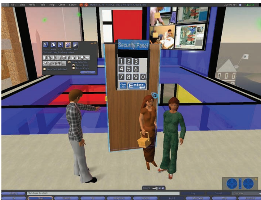
Fig. 2. Three avatars in SL making a door. In a virtual design studio, two scientists are admiring the work of a student intern (center) who is creating a set of displays demonstrating human-centered computing. After the combination lock has been set and made smaller, the door can readily be moved to its final location. Similar methods can be used to construct laboratory facilities and experimental equipment.

Political science uses the experimental method almost exclusively in small laboratory studies that mimic committee deliberations, and none of the social sciences experiment aggressively with social movements, simply because the cost and the ethical issues are daunting. This situation could change online, especially in role-playing games such as WoW, as long as the given experiment harmonized with the mythology of the virtual world. In the days before university committees on research with human subjects, it was not con-